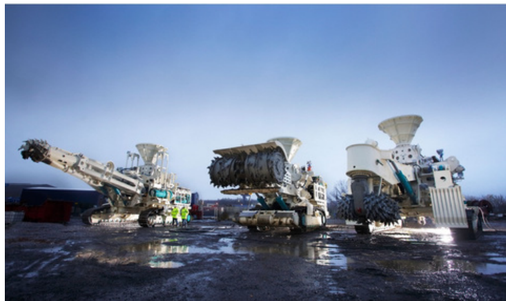
Deep-sea mining poses a threat to fisheries and ecosystems alike.

New research from MPAs around the world has shown signs of positive spillover effects that benefit nearby fisheries. For instance, findings from the Galápagos have shown that the iconic Galápagos Marine Reserve has had a positive impact on the productivity of yellowfin and skipjack tuna fisheries, proving that large pelagic MPAs can have a positive effect on these highly migratory species. Increasing protections to open waters around PRI could have a similar effect on these species.